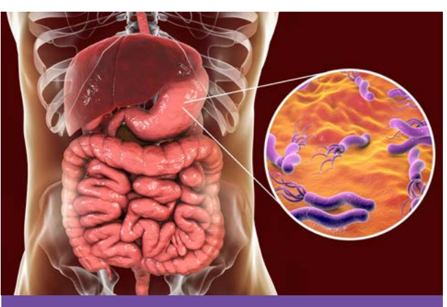
Helicobacter pylori bacteria colonising the stomach.

As an alternative in these cases a stool antigen test can be ordered.