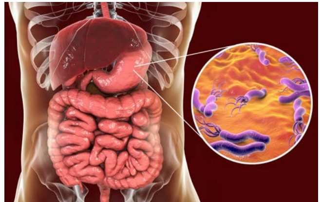
Helicobacter pylori bacteria colonising the stomach.

As an alternative in these cases a stool antigen test can be ordered.